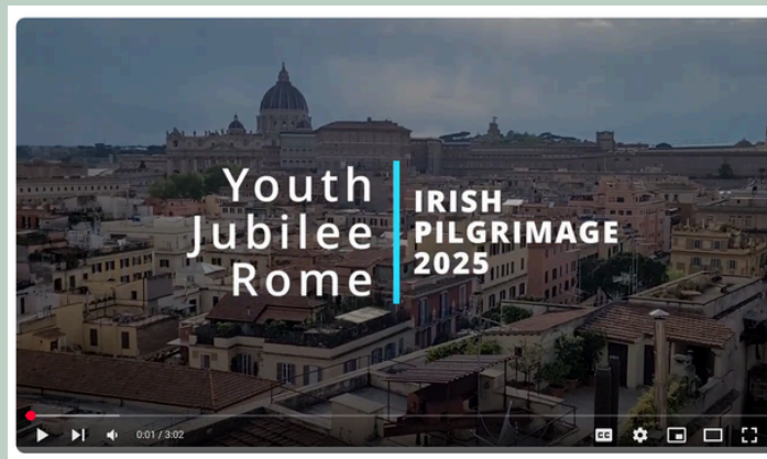
Jubilee of Youth - Irish Pilgrim Video 2025

We invite you to watch it together with your group, take time to reflect on the message, and encourage conversation on this powerful question.