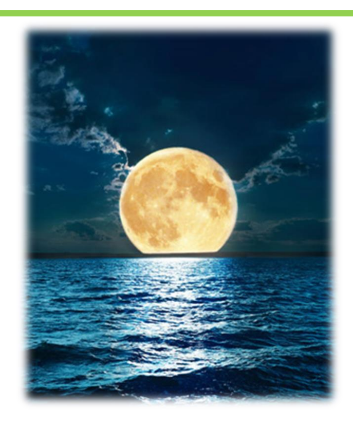
5. 4.3 billion years ago, the Moon was born.

A recent theory proposes that Earth, while still a fluid molten ball, was impacted by a Mars-sized planet that caused some of the outer layers of the molten Earth to splash out and solidify into the Moon. That would answer the question of why so much of the Moon's makeup is similar to that of Earth.