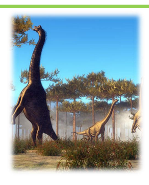
16. 235 million years ago - Dinosaurs

Dinosaurs first appeared 245 million years ago. They explored the extremes of size, speed and strength and ruled the Earth for 175 million years until wiped out 66 million years ago in the fifth Mass Extinction. Only the bird dinosaurs survived. The extinction was due to a triple disastrous event, involving asteroid impact, choking chemicals from volcanoes, and climate change due to the lengthy blocking out of the sun.