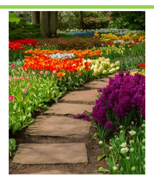
18. 150 million years ago Birds and Flowers

Birds evolved from a sub-group of ancestral dinosaurs, and Earth broke into song. Earth also adorned herself in colourful and fragrant flowers irresistible to insects. Birds and flowers are among the creatures that draw our universal respect. Imagine a silent and colourless world such as was portrayed by Rachel Carson in her Silent Spring, 1962! But a quarter of the world's bird species have been wiped out in recent years, so bird conservation is a pressing concern.