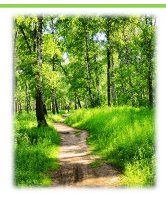
15. 335 million years ago Forests

It takes some 500 years to make a mature forest. Over generations, the early forests loaded themselves with carbon which they extracted from the atmosphere: this later became fossilized as coal and oil. Trees have been described as God's first temples. They are also a bit like monks who stay put, don't talk much but get on with inner growth. Trees work hard for us and for the environment, and also form a 'wood-wide web' of mutual communication and support. Mother trees recognize and talk with their kin, injured ones pass on their legacy to their neighbours; the healthy support the weak and give out warning signals to their friends when under threat. For instance, when a giraffe starts nibbling an acacia tree, the tree gives off an unpleasant gas: acacias close by pick up the message and pump unpalatable toxins into their leaves, so the hungry giraffe has to lunch elsewhere. A lesson here is that trees can smell! And when a caterpillar nibbles a leaf, electrical signals are emitted by the tree to ward off further damage. If the root is under attack, helpful fungi spread the word: their thin filaments are densely woven through the soil-one teaspoon of soil contains many miles of 'underground internet cable'. In this way, nutrients can be shared out to best advantage. A fungus in Oregon is perhaps 2400 years old, extends for 3000 acres and weighs 660 tons.