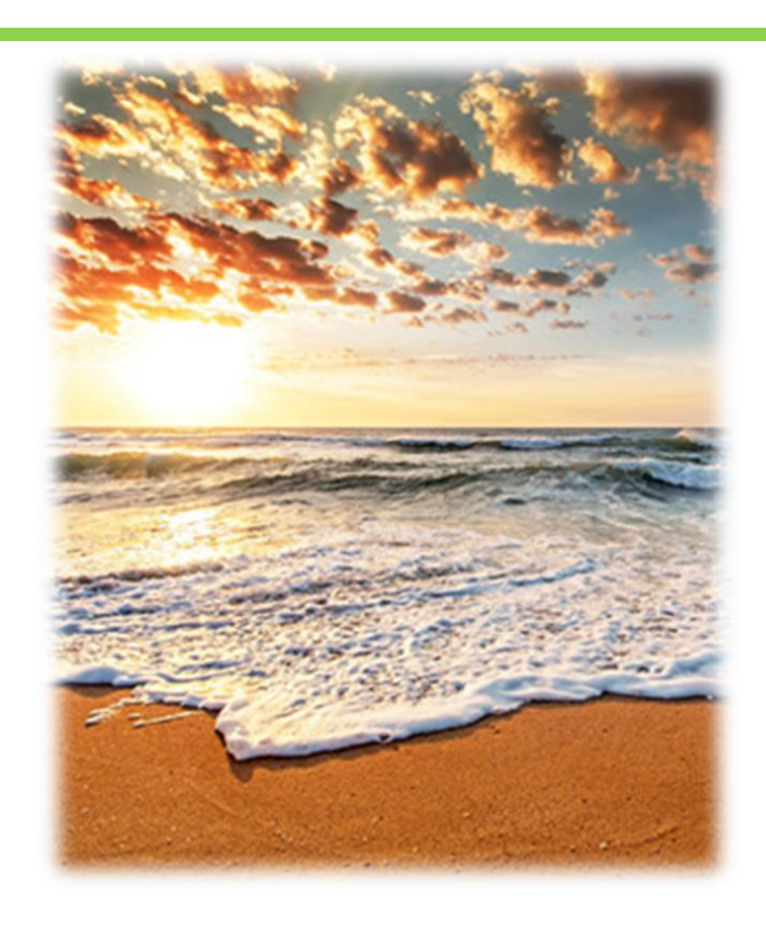
7. 4 billion years ago, the first cells were born and life began. Within the newly formed oceans a rich variety of chemicals gathered together in the form of bacteria. Earth awoke into life.

Life: Where did life come from? Whence the genetic code? The Royal Society's Evolution Prize for 2019, worth 10 million dollars, will be given to the first person who can bridge the gap between physics and biology. The winner must use only materials and conditions such as would have been to hand 4 billion years ago. Scientists give their lives trying to build even a single living cell. There are some 100 billion cells in your brain, and 37 trillion in your body!