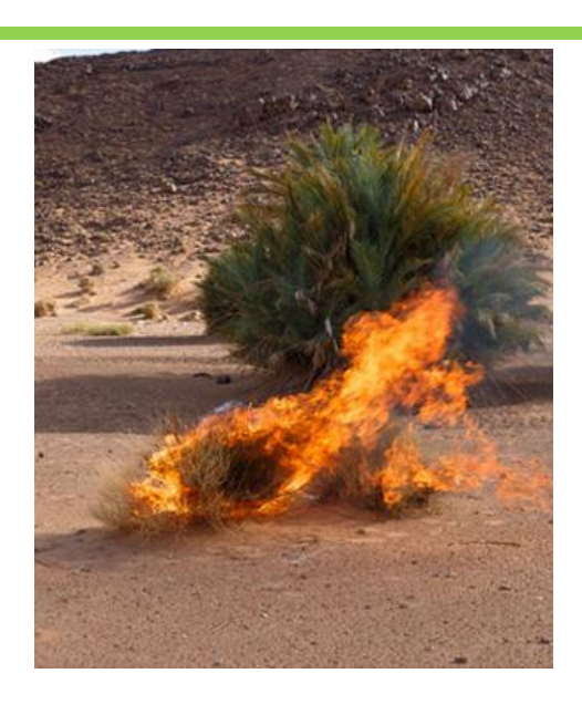
24. 5,000 years ago Empires and Religions

Agriculture led to collaboration and to cities. In the Near East empires emerged and disappeared: the Sumerian, Egyptian, Assyrian, Babylonian, Greek, Persian, Roman.