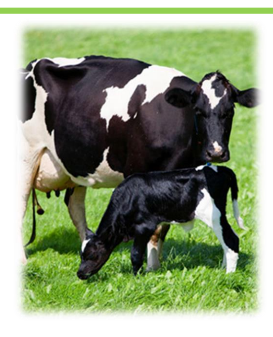
17. 200 million years ago Mammals

Mammals (mamma = breast or teat) evolved from ancestral reptiles. Reptiles are cold-blooded and depend on the sun's heat for energy, whereas mammals are warm-blooded, generate their own heat, and can move around more freely. The first mammals were small and nocturnal insect-eaters who learned to jump, climb, swing, and swim through a world of giants. The emergence of mammals was a triumph of nature's capacity for adaptation.