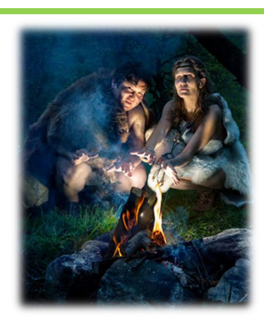
20. 6 million years ago The Ancestors of Homo sapiens

The Creation Walk is a story of ongoing change, development and novelty. New fossil discoveries and the use of DNA continue to rewrite the complex history of our family tree. Six million years ago saw the last grandparents of humans and chimpanzees. Creatures with ape-like protruding faces, powerful jaws and small brains began to leave the forest, stand up and walk on two legs. The savanna offered challenges and opportunities for these hominins–our earliest ancestors–to evolve.