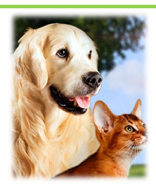
19. 60 million years ago The Carnival of the Animals

After the Fifth Mass Extinction, 66 million years ago, when the dominating dinosaurs had disappeared, Nature got to work again. Surviving small mammals began to evolve rapidly and diversify into a wide range of habitats. Earth greeted rodents, monkeys, horses, cats and dogs, elephants, chimpanzees, camels, bears and pigs.