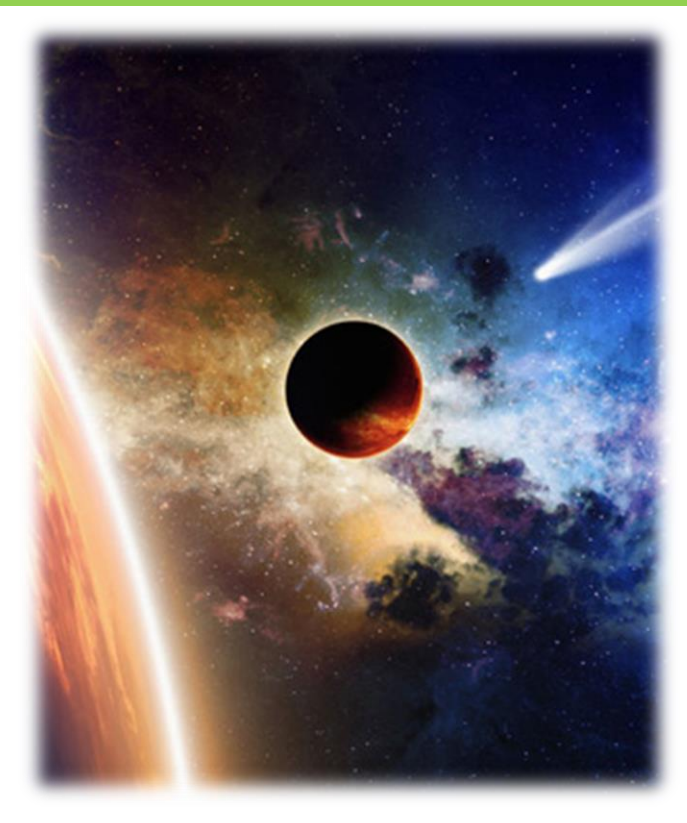
2. One billion years later, galaxies emerged.

Galaxies came forth as billions of stars made of hydrogen and helium. Larger stars in their death throes exploded and become supernovas. As they blasted out into the cosmos, they created in their wombs the heavier elements from which life will emerge.