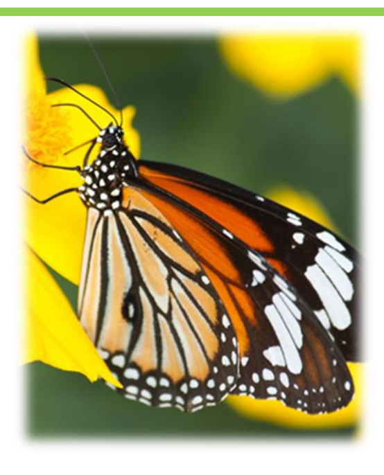
14. 400 million years ago - Flying Insects

Insects evolved with nearly weightless bodies that permitted them to take to the air as the first flying animals.