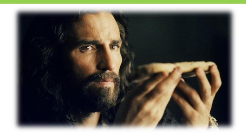
25. 2,000 years ago The New Creation

In the Christian view Jesus is not simply a religious leader among others, but the One who brings the process of evolution to an entirely new level.