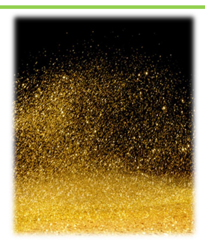
3. Two billion years later interstellar dust produced molecules.

Within the interstellar dust the chemical gifts of the supernovas were nurtured into simple organic molecules, vital components for the later emergence of life.