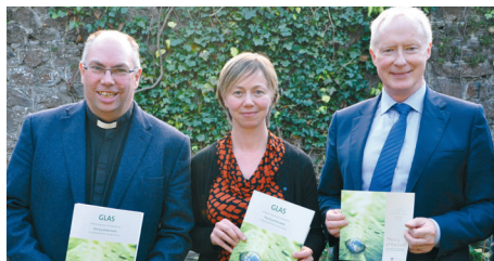
Launch of The Cry of the Earth , 1 October 2014