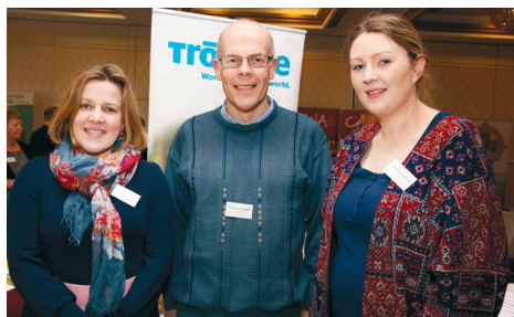
'Opening the Door of Mercy' conference in the Red Cow Hotel on Saturday 5 March 2016