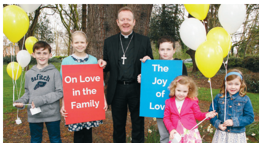
Archbishop Eamon Martin receives some assistance for the April 2016 launch of Amoris Laetitia in Ireland