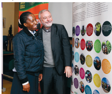
At the launch of the Missionary Exhibition highlighting the work undertaken by Irish missionaries to Kenya over a period of 100 years (1916-2016)