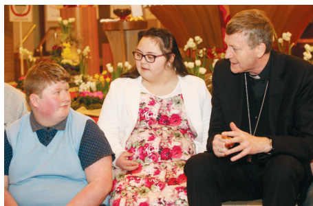
At the opening Mass for Catholic Schools Week 2017