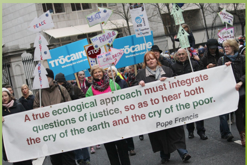
Prayer from Pope Francis' Encyclical "Laudato Si'" On Care for our Common Home