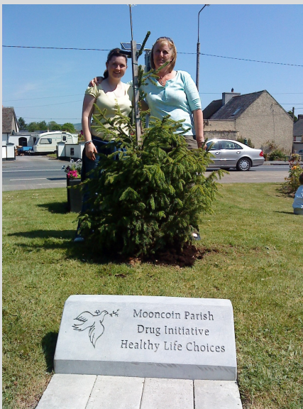
Ceremony of Mooncoin Parish Drug Initiative at unveiling of a plaque and planting of a tree as a sign of Hope for community against alcohol and other drug misuse.