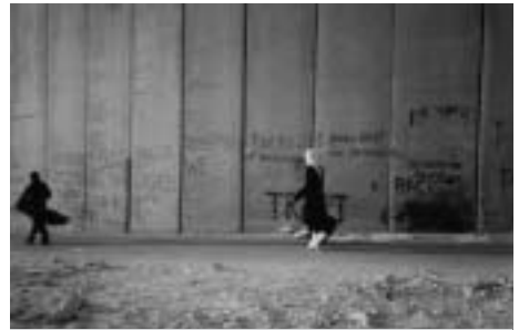
Women walking past the wall

In the past six years no fewer than 171 people have been killed in 38 suicide bombings in the city of Jerusalem alone. This wanton destruction of human life has left scars that will take generations to heal. Furthermore, the random nature of these deadly attacks means that there is an understandable sense of insecurity among the Israeli