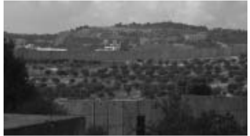
A view of Bethlehem from behind the Wall

Once a bustling cultural and spiritual centre hosting tourists and pilgrims from around the world, Bethlehem has become an isolated town with boarded up shops and abandoned development projects. The age old link between Bethlehem and Jerusalem – its spiritual, cultural and economic lifeline – has effectively been severed as a result of policies that include the