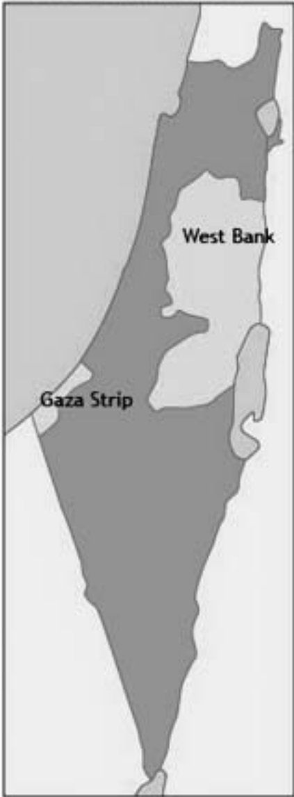
1967 Pre-Occupation Border 22% of Historic Palestine