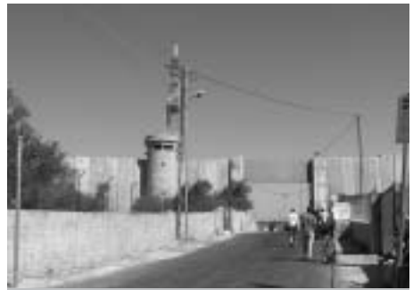
An Israeli checkpoint outside Bethlehem

Jewish settlements, the population of which has grown to more than 400,000, living in 144 settlements. Furthermore, the perceived need to protect these illegal settlements has led to a series of laws that have resulted in an unacceptably large number of Palestinians in Israeli prisons, the widespread use of detention without trial and a lengthy series of restrictions on the movement of Palestinians in the occupied territories. Together with numerous checkpoints and roadblocks and the building of the separation wall, basic human rights of the Palestinians were violated: freedom of movement, free access to holy places in Jerusalem, freedom for business and economic development and free access to adequate educational or medical facilities.