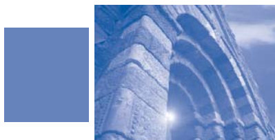
BISHOP OF KILDARE AND LEIGHLIN

'Look, I have set before you an open door'