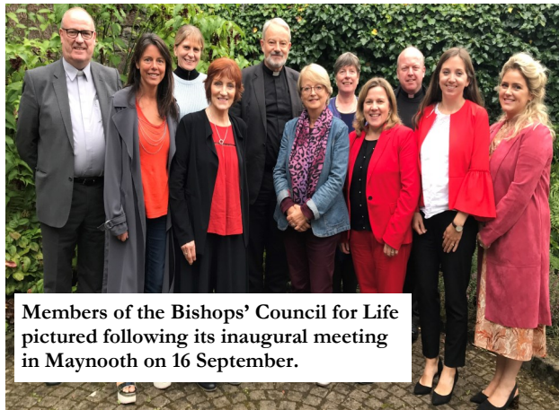
Members of the Bishops' Council for Life pictured following its inaugural meeting in Maynooth on 16 September.