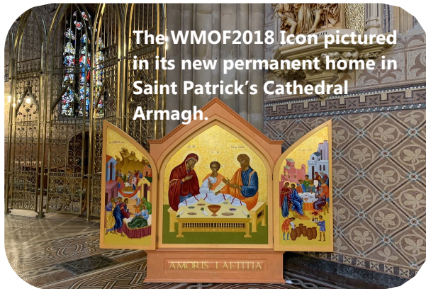
The WMOF2018 Icon pictured in its new permanent home in Saint Patrick's Cathedral Armagh.