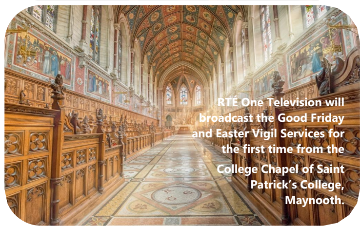
RTE One Television will broadcast the Good Friday and Easter Vigil Services for the first time from the College Chapel of Saint Patrick's College, Maynooth.

See www.catholicbishops.ie for details of Holy Week and Easter Services, including Dawn Masses for Easter Sunday.