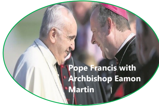
Pope Francis with Archbishop Eamon Martin

Commenting on his appointment, Archbishop Eamon said, "I am humbled by Pope Francis' request and grateful for his confidence in me. It will be an honour for me to serve the people, priests and religious of Dromore during this transitional time for the diocese. Please pray for me as I take up this new responsibility." For more see catholicbishops.ie.