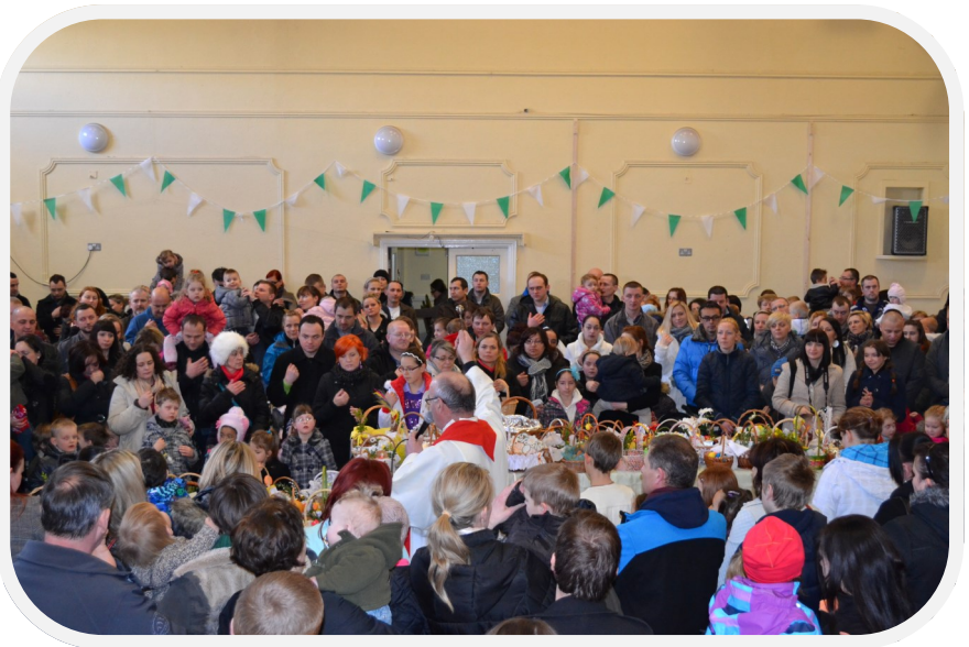
The Good Shepherd Parish, Doughiska, Co. Galway